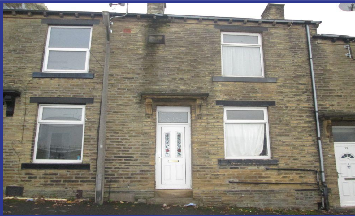
27 Arctic Parade Bradford, BD7 3EY